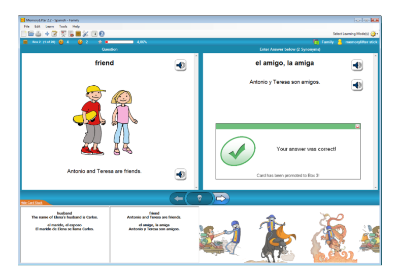
MemoryLifter Learning Environment