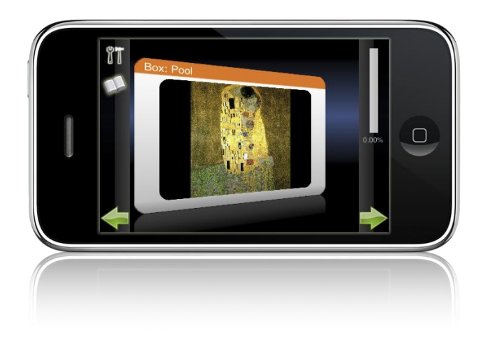
MemoryLifter for the iPhone (Bundled with 1,000 famous paintings Learning Module)