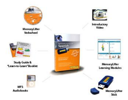
Multimedia Learning Suite: Spanish