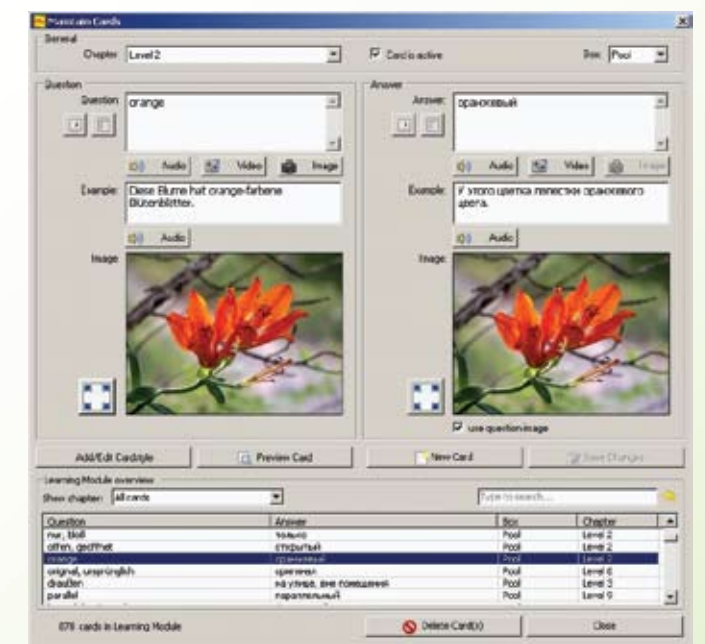
Figure 3: MemoryLifter card editor

Flashcards are quizzed, sorted into virtual boxes of increasing size and subsequently presented to the learner at spaced time intervals (see Figure 1). One main advantage of this system is the highly individualized study environment that is created. For example, the speed of the learning and the number of repetitions are completely dependent on the individual progress of each user. Learning is highly targeted to the material that is not yet mastered, because card content that is not known (or has been forgotten) is presented at a higher frequency, while repetitions of material that is already known are reduced. At the same time, MemoryLifter features a range of sophisticated card editing and maintenance tools, which allow the user to easily create his/her own multi-media learning modules or to customize existing learning modules with additional flashcards and desired mnemonic elements like images or audio files (see Figure 3).